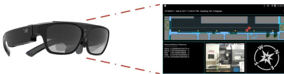
Fig. 2. Presentation of information with Smart Glasses (ODG R-7, real screenshot of Smart Glasses on right).

For the fourth International Center for Turbomachinery Manufacturing, we have developed a software demonstrator combining smart glasses and the indoor localization service described in the last section (Fig. 2). A sensor network of Bluetooth beacons was deployed alongside an aisle of our machine hall with five meters to each other. Their absolute positions are stored locally in the Smart Glass as references.