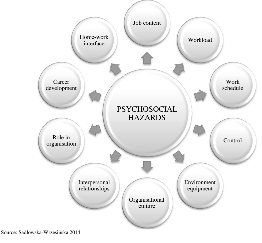
Fig. 1. Psychosocial hazards related to work Rys. 1. Zagrożenia psychospołeczne związane z pracą

According to literature on the subject and research in the field, a rough set of psychosocial work environment factors, which workers consider to be stressful or potentially harmful, was put together. This way 10 separate categories concerning job characteristics, organization and management of work as well as other environmental and potentially health-hazardous organizational factors were established. In specific conditions every one of the 10 aspects of work causes stress and/or is directly hazardous towards health [WHO 2008].