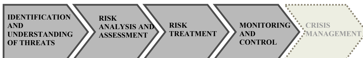
Fig. 2b. Crisis and risk management process Rys. 2b. Proces zarządzania ryzykiem i kryzysem

Risk Management approach gives no direct relevance to Crisis Management, no junction to that - whatever to say - possible extensure of events, which we used to call "crisis". The term "crisis" itself is rather absent in the literature concerning risk management. Also in numerous taxonomies and risk categorizations proposed, there is no reference to this quite real after-effect of various threats. Considering all the convergences - substantial identity as well as formal resemblance of procedures, it seems to be reasonable to recognize crisis management as the next (potential) step in risk management process (Fig. 2b).